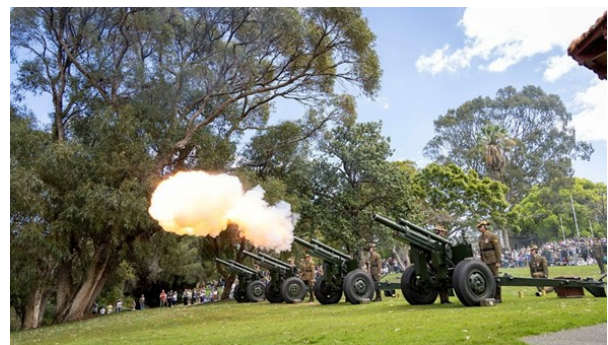
3 Battery conducts Kings Birthday Salute at Kings Park, WA