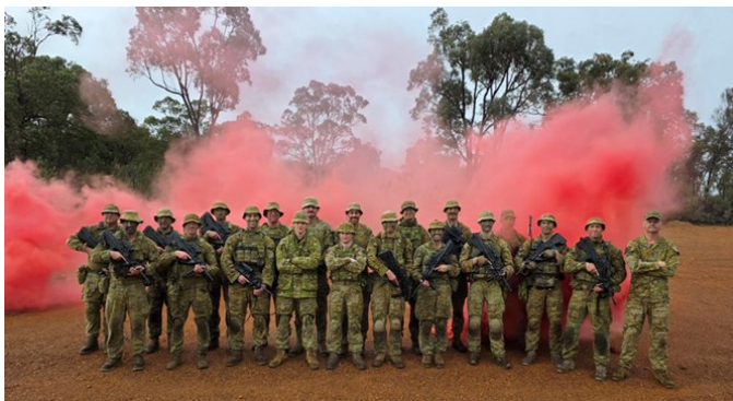
Battery Members at the end of EX HOBBS RUN at Bindoon Training Area, WA

3 Battery continues to demonstrate adaptability, technical expertise, and dedication to tradition. As we look forward to international engagement and festive celebrations, our team remains ready to meet every challenge with professionalism and pride