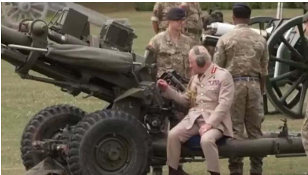
King Charles during a visit to Larkhill Barracks 6 June 2025

In Australia, on the other hand, June marks the beginning of Winter and it is one of the coolest and wettest months, although, the weather is always better than anywhere else.