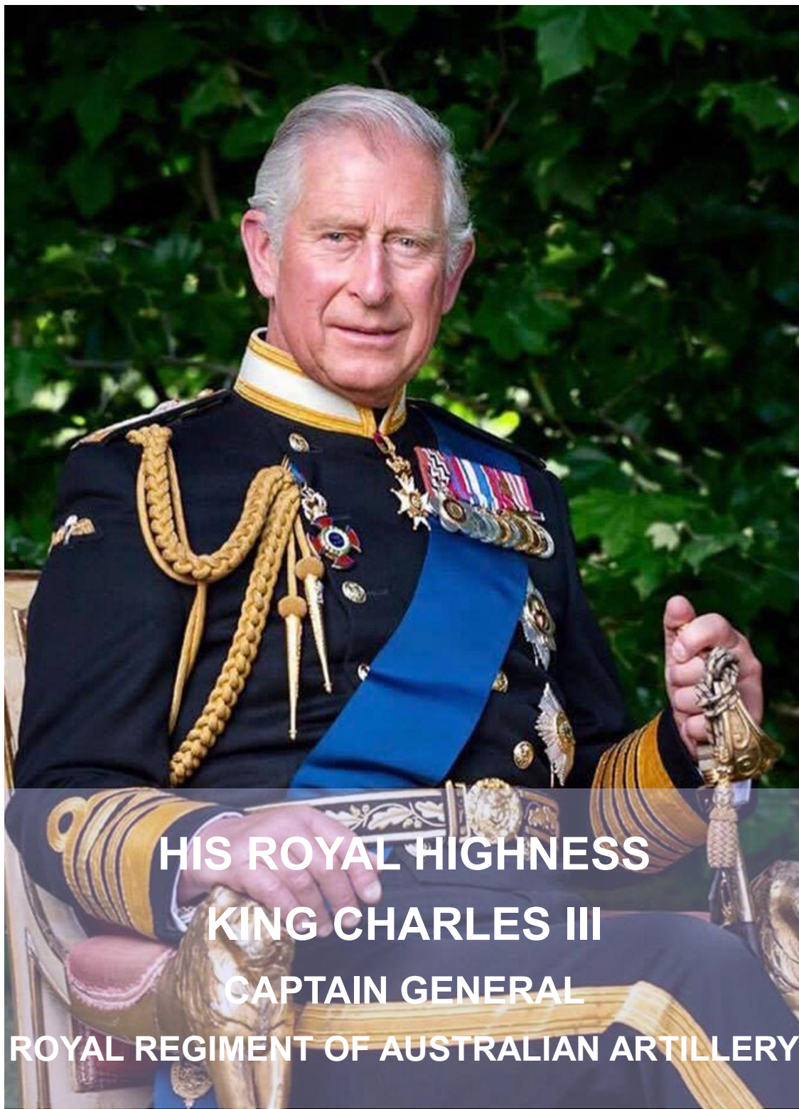
HIS ROYAL HIGHNESS KING CHARLES III CAPTAIN GENERAL ROYAL REGIMENT OF AUSTRALIAN ARTILLERY