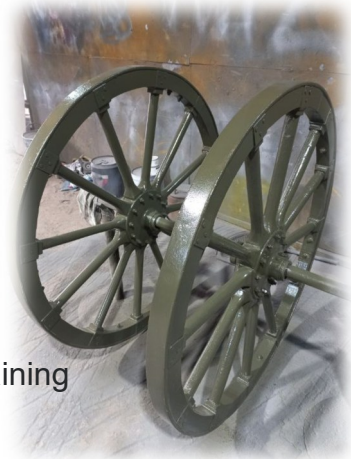
Both wheels required new retaining collars and pins to be made.