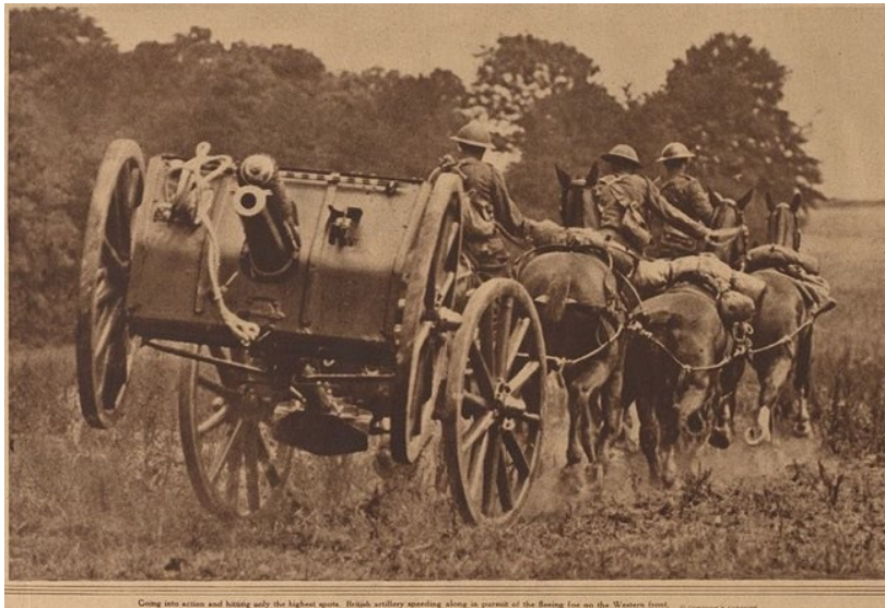
Going into action and hitting only the highest spots. British artillery speeding along in pursuit of the Boer line on the Western front.

We felt warm blood run down, "As we turned for the stretching gallop, Crushed to the earth with weight; But we carried our riders through it — Sometimes, perhaps, too late. "Steel! We were steel to stand it — We that have lasted through, We that are old campaigners Pitiful, poor, and few. "Over the sea you brought us, Over the leagues of foam: Now we have served you fairly Will you not take us home? "Home to the Hunter River, To the flats where the lucerne grows; Home where the Murrumbidgee Runs white with the melted snows. "This is a small thing, surely! Will not you give command That the last of the old campaigners Go back to their native land?" They looked at the grim commander, But never a sign he made. "Dismiss!" and the old campaigners Moved off from their last parade.