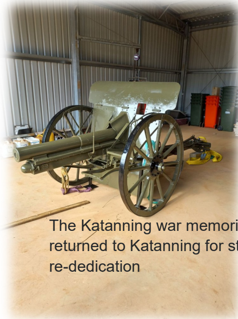
The Katanning war memorial trophy field gun returned to Katanning for storage and awaiting re-dedication