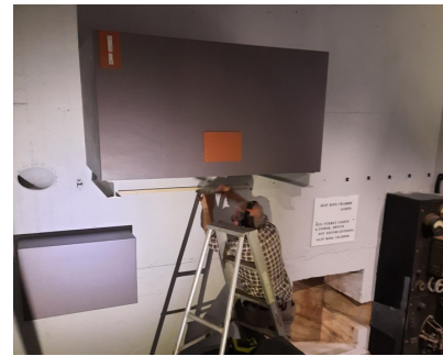
JIM INSTALLS LIGHTING ON A DISPLAY IN THE ENGINE ROOM