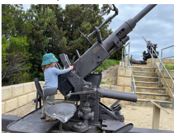
George September 2024

Warm regards, Stacey Brown (nee Furlong)