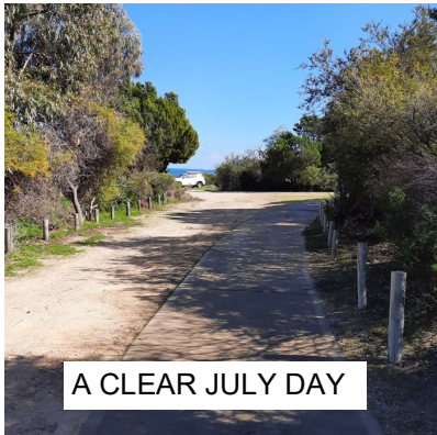
A CLEAR JULY DAY