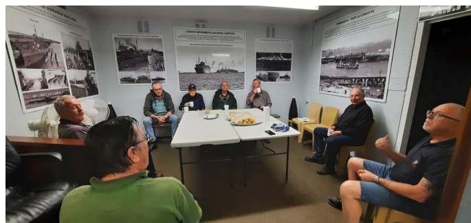
LUNCH—A TIME FOR REFRESHMENTS, MEAT AND CONVERSATION