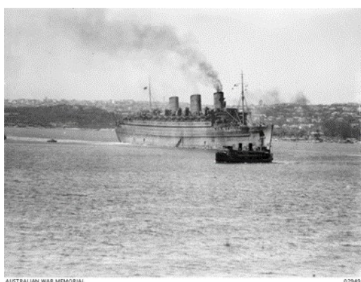
Photo Caption : HMT Queen Mary entering Sydney Harbour 27 Feb 43