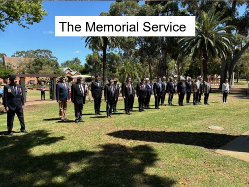
The Memorial Service