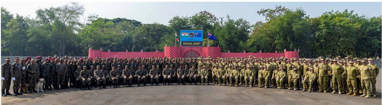
The opening ceremony of Exercise AUSTRAHIND was held on November 8, 2024 at the Foreign Training Node in Pune, Maharashtra