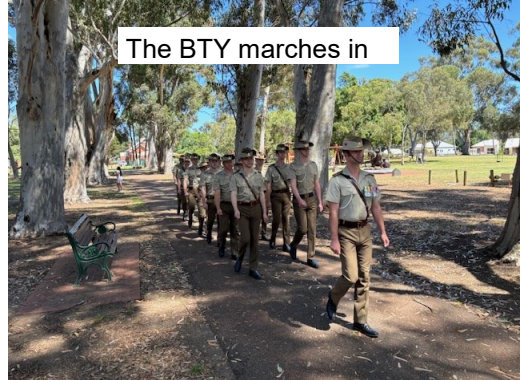
The BTY marches in