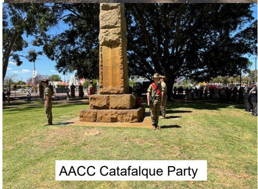
AACC Catafalque Party