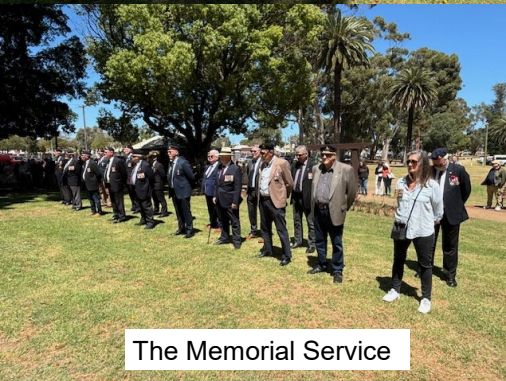
The Memorial Service