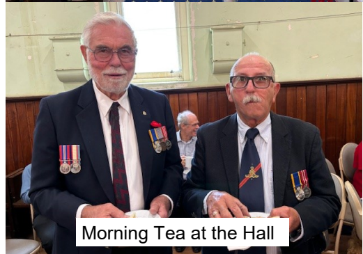
Morning Tea at the Hall