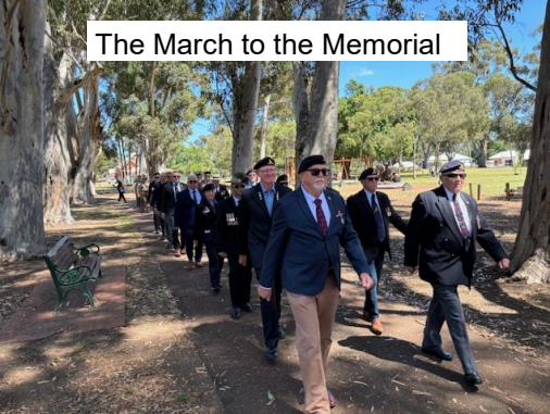
The March to the Memorial