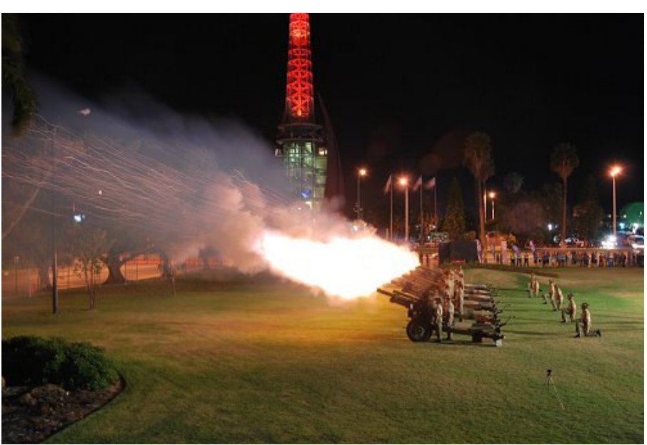
7 Fd Bty RAA firing during the 1812 Overture December 2009 - The Esplanade, Perth