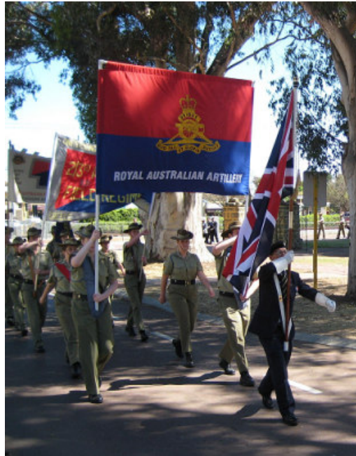
GUNNERS' DAY 2009