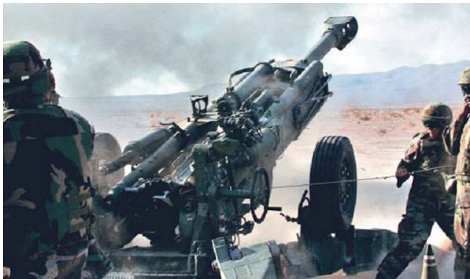
Fire for effect: A British variant of the M777A2 155mm lightweight towed howitzer in action.