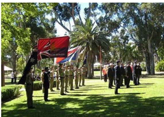
Wreath laying service