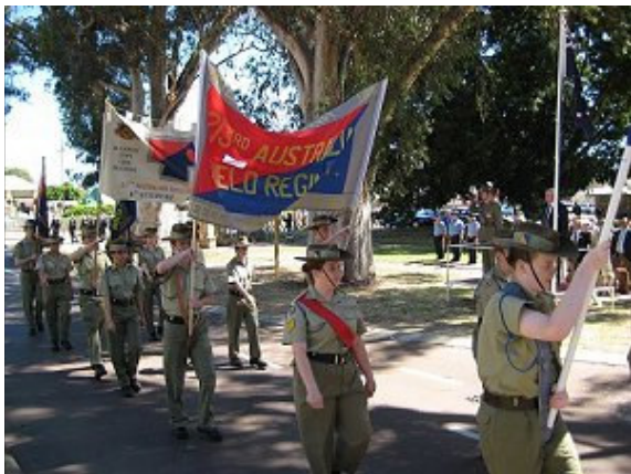
Cadet flag bearers