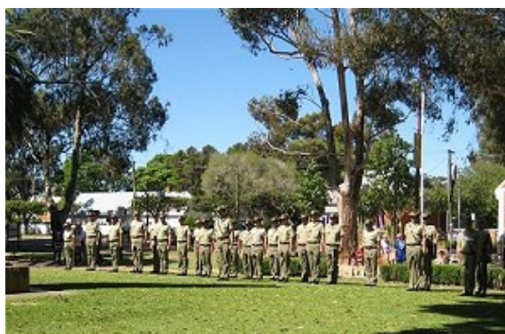
7 Fd Bty RAA