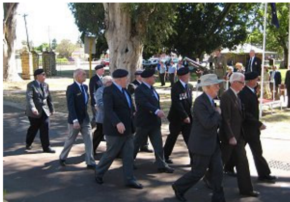
Association members marching