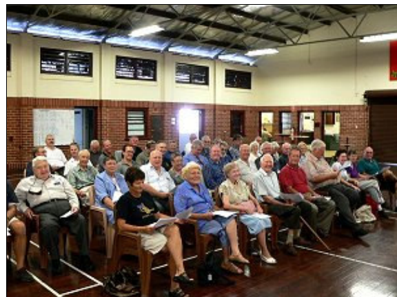
Members in attendance at the AGM Hobbs Artillery Park on Sunday 8 th March