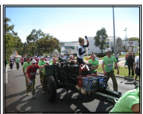
The Gun Detachment